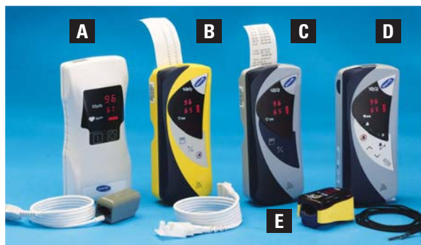
(A) IRC700 (B) IRC725 (C) IRC735 (D) IRC775 (E) IRC600